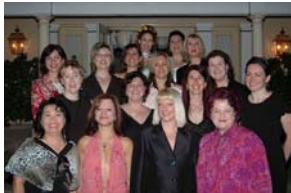
Camtu with other finalists